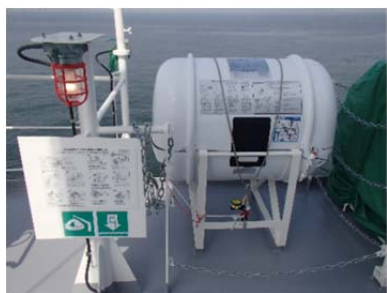
Davit Launched Liferaft

When replacing a liferaft, please confirm once again if the type of liferaft arranged by a serving firm is appropriate or not.