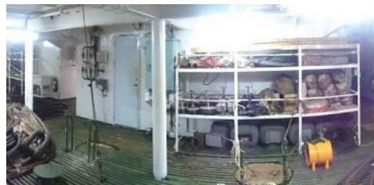
Figure 1: Forepeak stores looking aft. The manhole that was opened is on the centerline; the manhole on the starboard side was left closed.