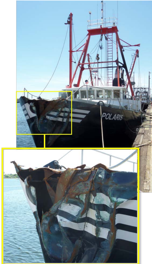
Area of greatest damage to hull of Polaris .

9 months prior to joining the Tofteviken in April 2018. The AB on the Tofteviken , who had completed several contracts on the ship during the last 4 years, had been working the same watch schedule as the third mate since she joined the ship the previous month.