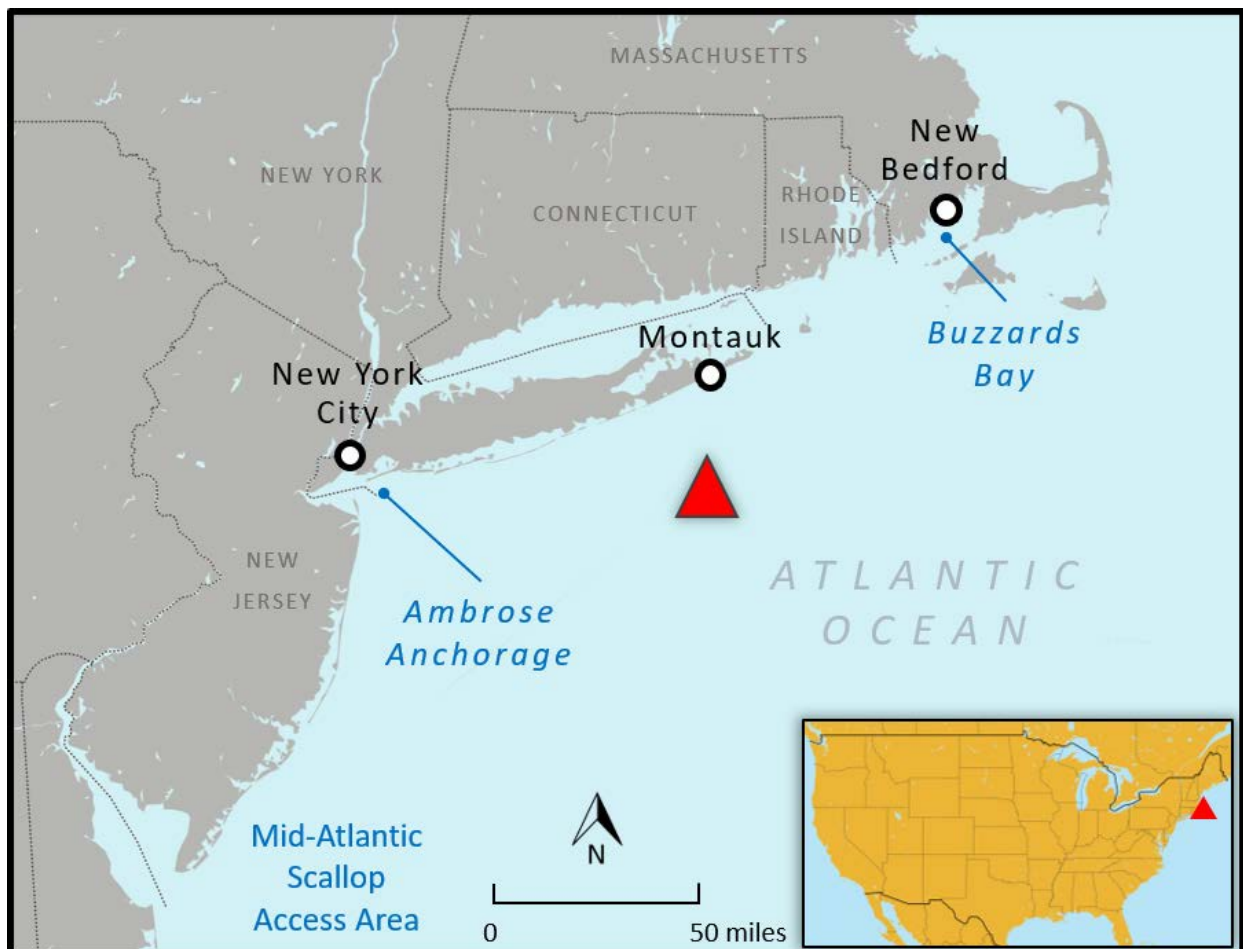
Area of accident where vessels collided, as indicated by red triangle.

On the day of the accident, sunset was at 1955 local time. Visibility was good, wave heights were about 2–4 feet, and winds were light from the southwest.