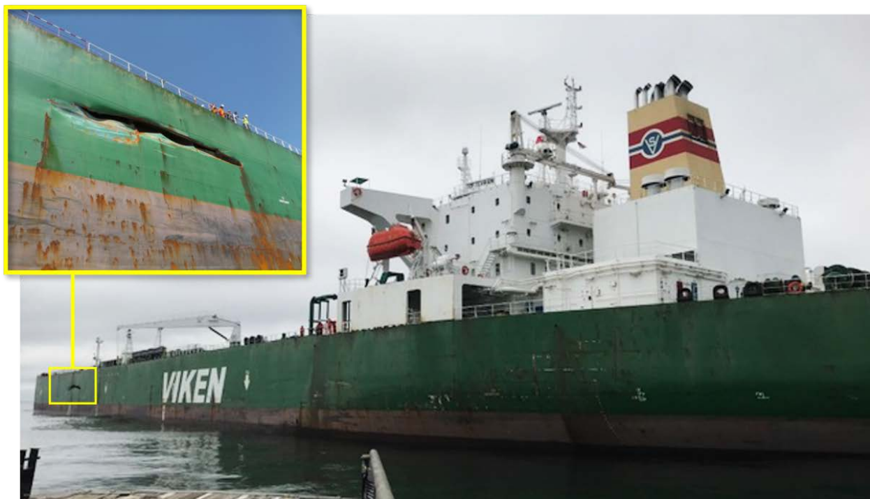
Main damage area of hull of Tofteviken .

Damage. The Tofteviken 's port side shell plating sustained damage consisting primarily of a 40-foot-by-2-foot gash in the hull below the main deck into the port water ballast tank no. 3 (which was empty), along with multiple scrapes down the ship's side. There was no damage to any of the cargo tanks.