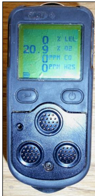
Figure 4: GMI type PS241 gas detector

The gas detector alarms for H 2 S were set at 5 ppm for high alert and 10 ppm for high-high alert.