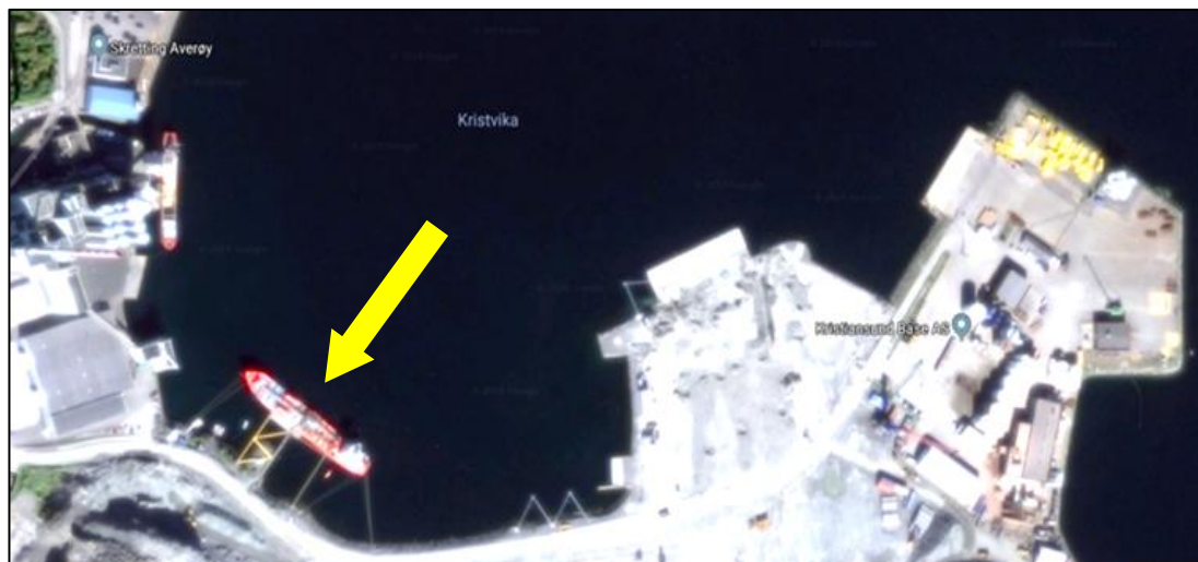
Figure 5: Crude Passion moored at Averøy

At 0945, on 31 August, Key Fighter arrived at Averøy and moored alongside the chemical / oil tanker Crude Passion 5 (Figure 5). Key Fighter commenced discharge of the remaining Rapeseed oil from cargo tanks nos. 3, 4, 5 and 6 port and starboard. The cargo discharge was completed at 1945.