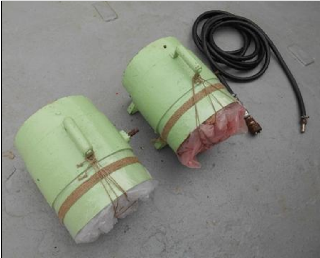
Figure 3: Portable ventilation fans

air and consisted of a metal fan enclosure with a plastic extension hose which was placed into the tank through the tank-hatch.