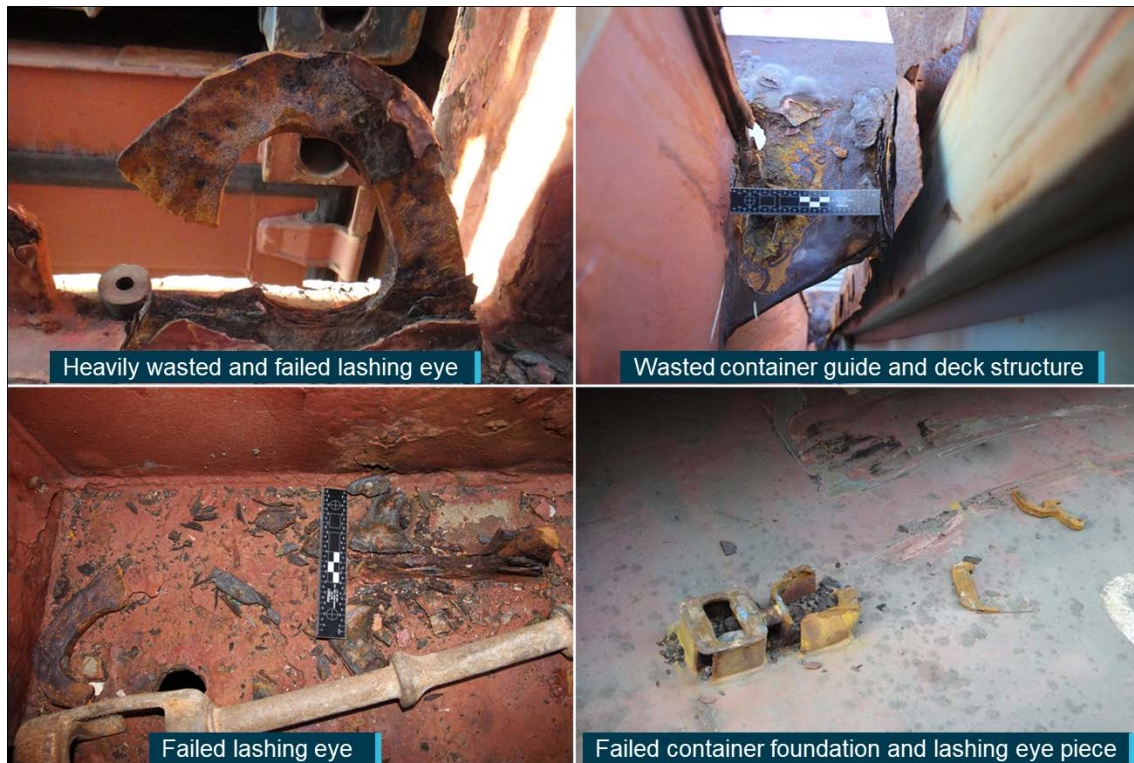
Figure 4: Examples of condition of cargo securings and ship structure