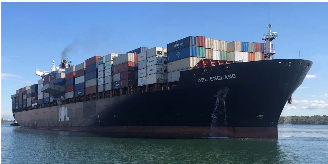
Figure 1: APL England arriving into Brisbane

On 22 May, the master received weather advice from the CMA CGM group Fleet Navigation Centre (FNC) regarding a low pressure system and high swells (5–6 m) developing off the New South Wales coast. The master monitored the weather forecasts via updates from the commercial Ship Performance Optimization System (SPOS) service, with which the ship was a registered user.