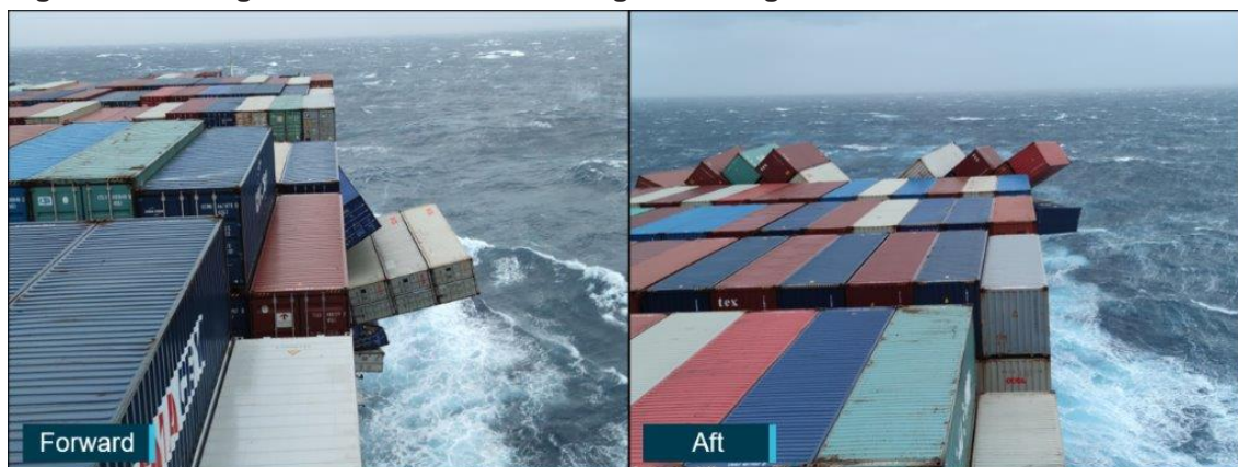
Figure 3: Looking forward and aft from navigation bridge at about 0700

As the skies lightened (sunrise was at 0647), the chief officer noticed fallen stacks of containers aft (bay 62) (Figure 3). The master notified the company of the incident. Upon returning to the bridge about 10 minutes later, the master was notified by the chief officer of the damage and loss of containers forward (bay 30).