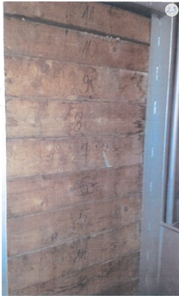
Figure 4. The plank barrier seen from the lashing equipment room. Wood pellets in the cargo hold are visible between planks 10 and 11. The barrier is evidently not gastight. (CORINA).

In line with the International Maritime Solid Bulk Cargoes (IMSBC) Code, the shipper had declared the hazardous nature of the cargo. The wood pellets were declared as a group B cargo and marked as Materials Hazardous only in Bulk (MHB), which covers materials that may possess chemical hazards when carried in bulk. The shipper had provided several safety recommendations, only allowing entry to the cargo hold after 2 h of natural ventilation and measurements of oxygen content and dangerous gasses, carbon monoxide included.