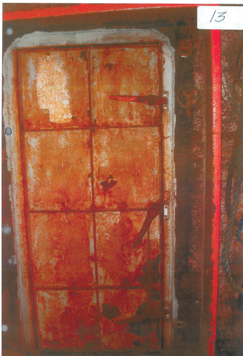
Figure 1. The door in the forepeak compartment, which led the front cargo hold. The door had three closing hinges but only two were engaged. Gasses travelled from the cargo hold to the forepeak through a crevice where the third hinge was not engaged. (AMIRANTE).

The crew was at pains to explain why the two seamen would go down the forepeak. They had no business down there whatsoever. It was suggested that they might want to check if there was sufficient room for stowage of the old mooring ropes.