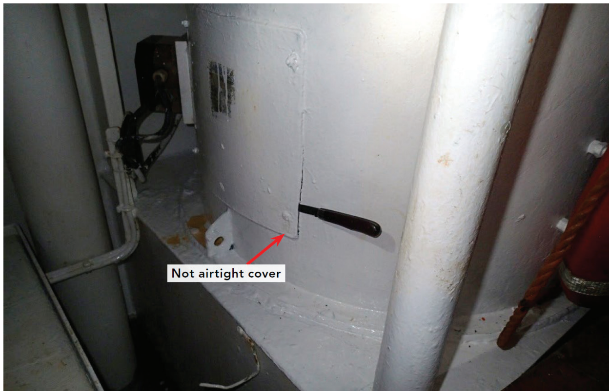
Figure 2. The inspection hatch on a ventilation duct that ran from the cargo hold through the forecabin. A minor gap in a section of the rim (knife blade inserted) allowed gasses to travel from the cargo hold to the bow area. (LADY IRINA). Source: [13].

In response to the fatal accident, the shipping company acquired multi-gas meters and introduced a new work procedure mandating that the person making “First Entry” must carry an operational multi-gas meter. New warning placards with the instruction “ATTENTION—No first entry without use of multi-gas meter” were been put up on access doors.