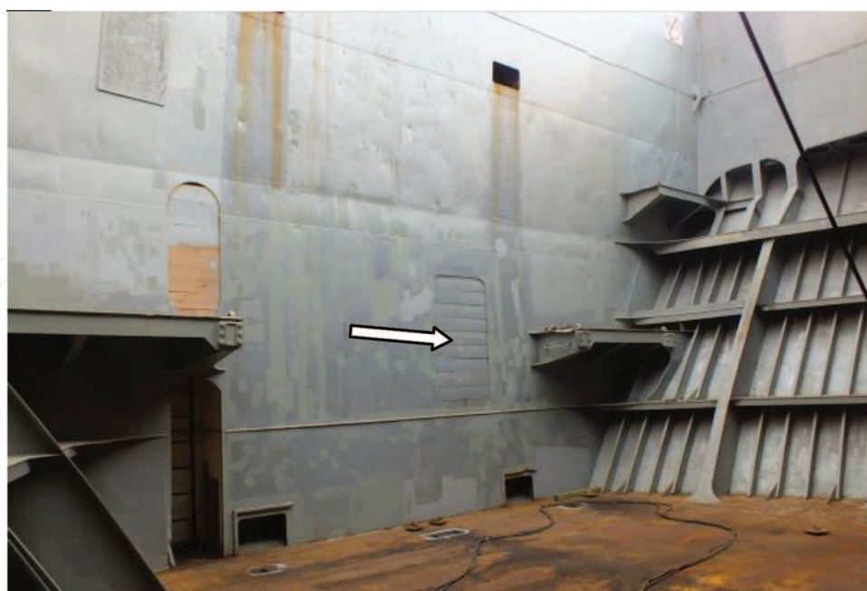
Figure 3. An opening in the front cargo hold allowed easy access to the lashing equipment room. When carrying bulk cargo, the opening was closed with planks of wood inserted into guide bars (CORINA).

The crew was at pains to explain why the able seaman would enter the lashing equipment room. He had no business down there whatsoever and had not requested permission or informed anybody of his intention to go there. He was supposed to be on watch near the gangway.